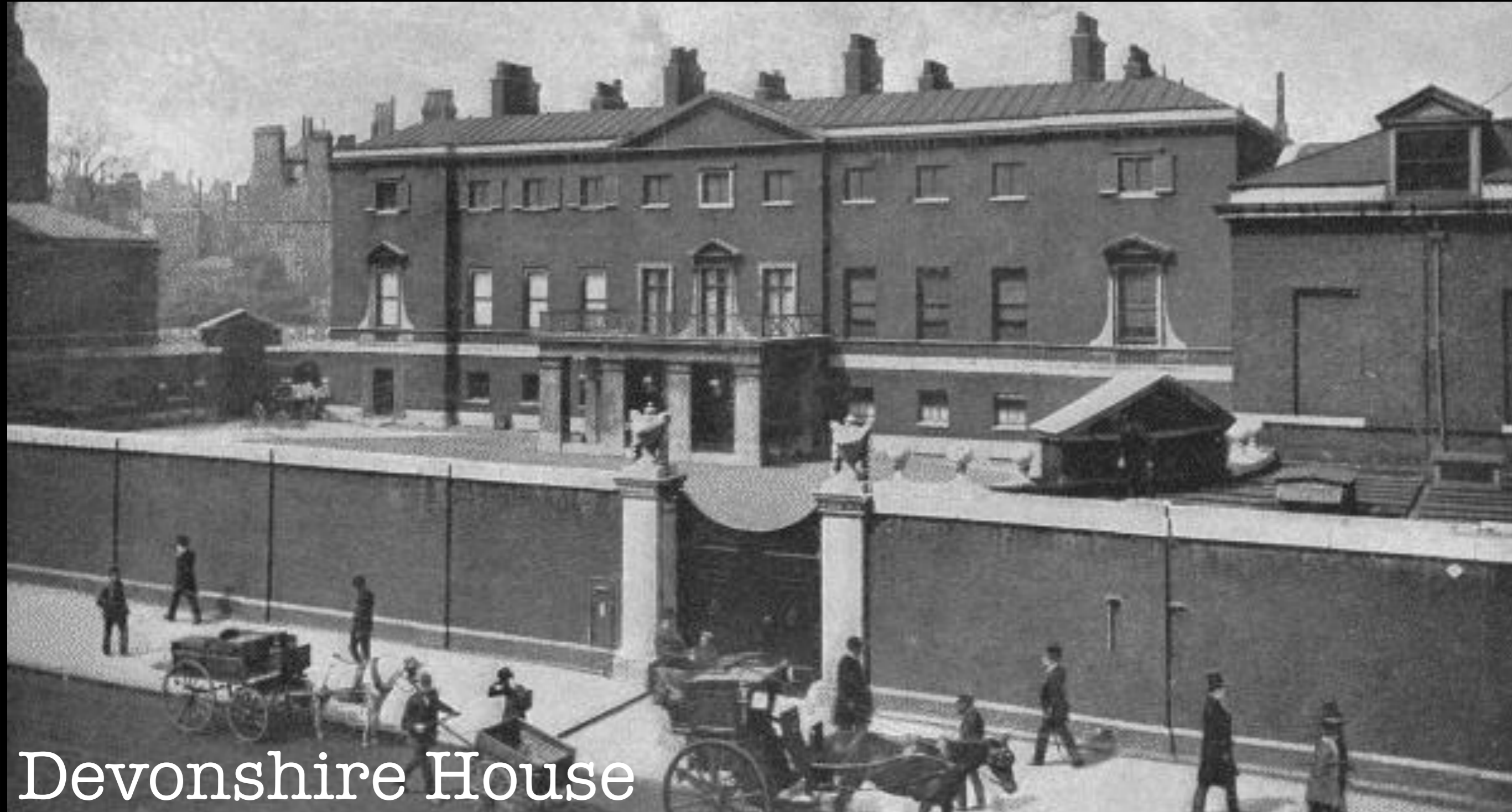
Devonshire House Demolished 1924

Understanding the use of architectural stand-ins in heritage cinema: